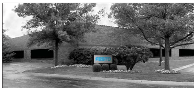
Central: 1441 East Business Center Drive, Mt. Prospect, IL 60056