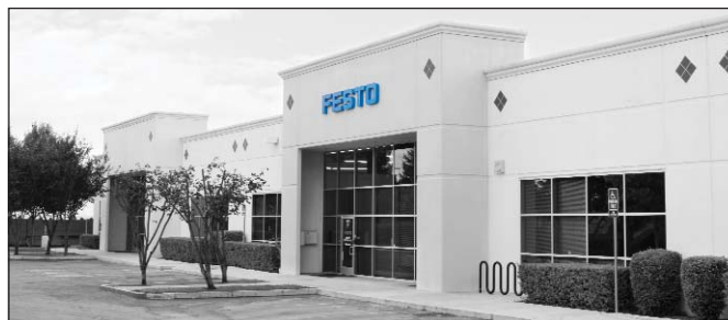
West: 4935 Southfront Road, Suite F, Livermore, CA 94550