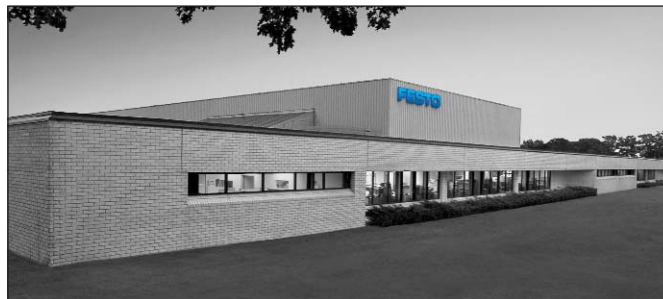
East: 395 Moreland Road, Hauppauge, NY 11788