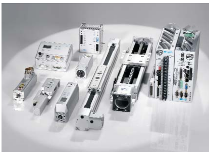
Electromechanical Electromechanical actuators, motors, controllers & drives

With a comprehensive line of more than 30,000 automation components, Festo is capable of solving the most complex automation requirements.