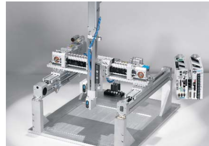
Complete Systems Shipment, stocking and storage services