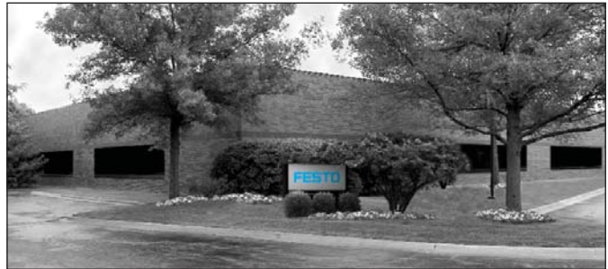
Central: 1441 East Business Center Drive, Mt. Prospect, IL 60056