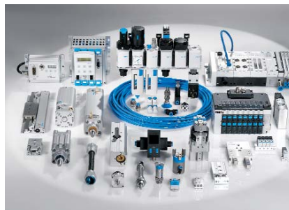
Pneumatics Pneumatic linear and rotary actuators, valves, and air supply