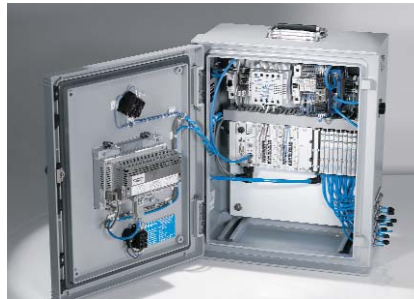
Custom Control Cabinets Comprehensive engineering support and on-site services