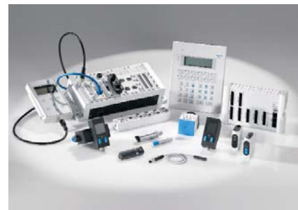
PLCs and I/O Devices PLC's, operator interfaces, sensors and I/O devices