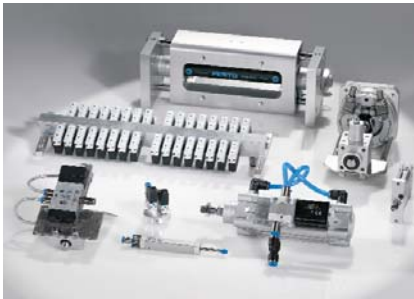
Custom Automation Components Complete custom engineered solutions

Our experienced engineers provide complete support at every stage of your development process, including: conceptualization, analysis, engineering, design, assembly, documentation, validation, and production.