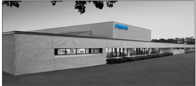
East: 395 Moreland Road, Hauppauge, NY 11788