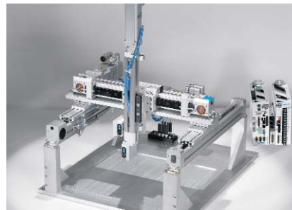
Complete Systems Shipment, stocking and storage services