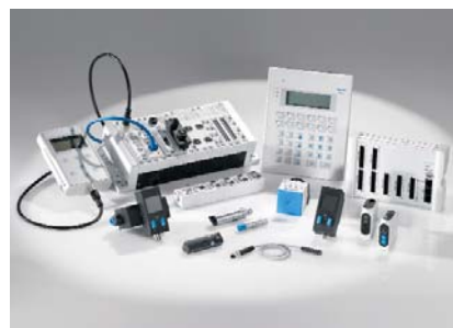
PLCs and I/O Devices PLC's, operator interfaces, sensors and I/O devices