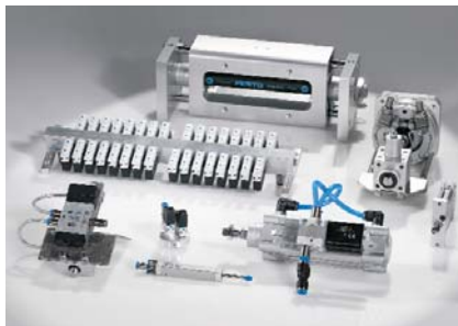
Custom Automation Components Complete custom engineered solutions

Our experienced engineers provide complete support at every stage of your development process, including: conceptualization, analysis, engineering, design, assembly, documentation, validation, and production.