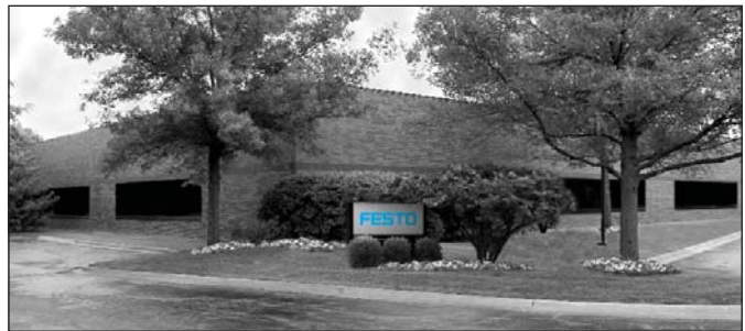
Central: 1441 East Business Center Drive, Mt. Prospect, IL 60056