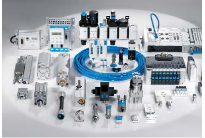
Pneumatics Pneumatic linear and rotary actuators, valves, and air supply