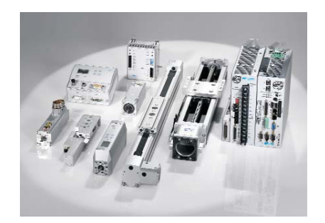
Electromechanical Electromechanical actuators, motors, controllers & drives

With a comprehensive line of more than 30,000 automation components, Festo is capable of solving the most complex automation requirements.