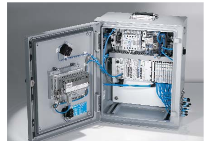
Custom Control Cabinets Comprehensive engineering support and on-site services