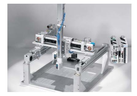
Complete Systems Shipment, stocking and storage services