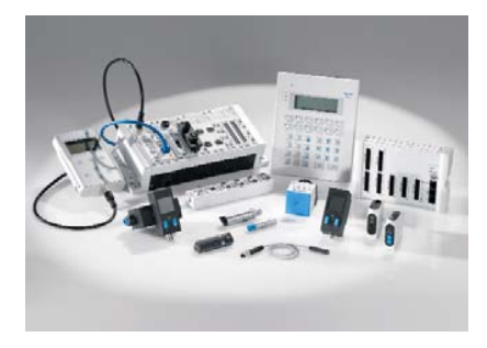
PLCs and I/O Devices PLC's, operator interfaces, sensors and I/O devices