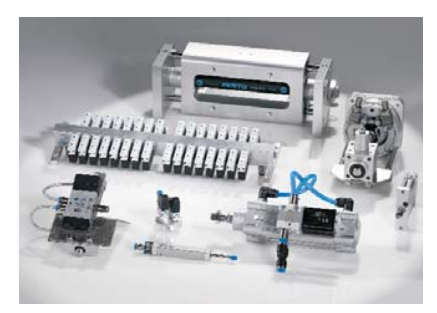
Custom Automation Components Complete custom engineered solutions

Our experienced engineers provide complete support at every stage of your development process, including: conceptualization, analysis, engineering, design, assembly, documentation, validation, and production.