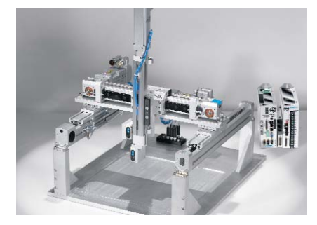
Complete Systems Shipment, stocking and storage services