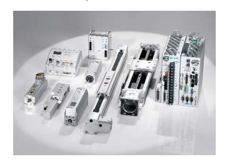
Electromechanical Electromechanical actuators, motors, controllers & drives

With a comprehensive line of more than 30,000 automation components, Festo is capable of solving the most complex automation requirements.