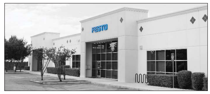
West: 4935 Southfront Road, Suite F, Livermore, CA 94550