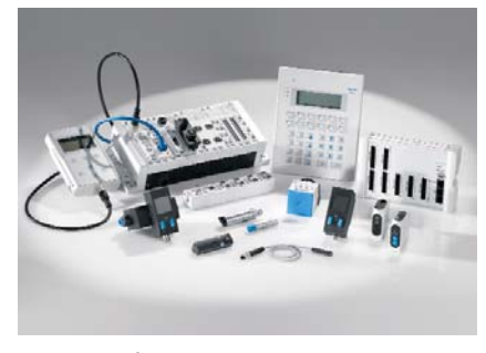
PLC's and I/O Devices PLC's, operator interfaces, sensors and I/O devices