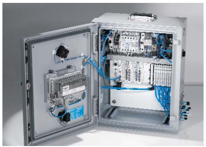
Custom Control Cabinets Comprehensive engineering support and on-site services