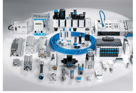
Pneumatics Pneumatic linear and rotary actuators, valves, and air supply