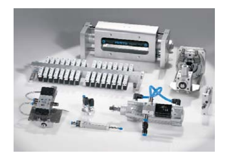
Custom Automation Components Complete custom engineered solutions

Our experienced engineers provide complete support at every stage of your development process, including: conceptualization, analysis, engineering, design, assembly, documentation, validation, and production.