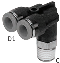
Push-in Elbow Y Fitting, NPT