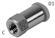
Push-in Straight Fitting, UNF, with Female Thread