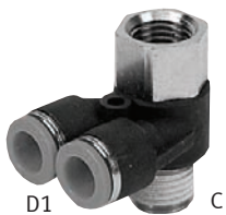
Push-in Elbow Y Fitting, NPT, with Male and Female Thread