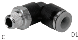
Push-in Elbow Fitting, NPT