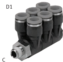
Push-in Elbow Triple Y Fitting, NPT