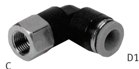
Push-in Elbow Fitting, NPT, with Female Thread