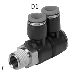
Push-in Double Elbow Fitting, NPT