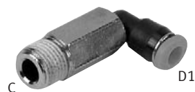
Push-in Elbow Fitting, NPT, Long