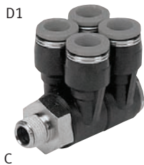
Push-in Elbow Double Y Fitting, NPT