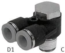
Push-in Elbow Y Fitting, NPT, with External Hex