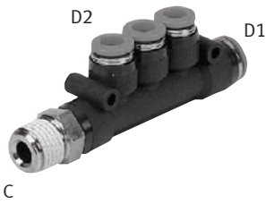
Push-in Triple Branch Reducing T Fitting, NPT