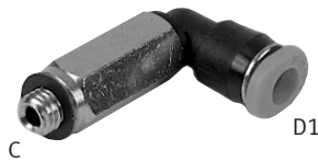
Push-in Elbow Fitting, UNF, Long