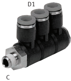
Push-in Triple Elbow Fitting, NPT