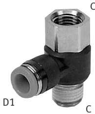
Push-in T Fitting, NPT, with Male and Female Thread