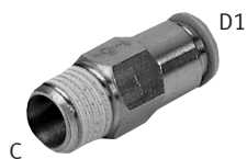
Push-in Straight Fitting, NPT, with Internal Shut-off