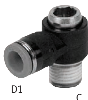
Push-in Elbow Fitting, NPT, with Internal Hex