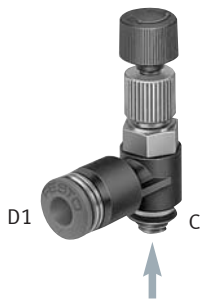
Differential Pressure Regulator, NPT, with Elbow Connector Housing: Polymer