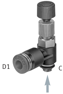
Differential Pressure Regulator, UNF, with Elbow Connector Housing: Polymer