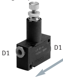
Pressure Regulator, without Gauge, with 2 Connectors Housing: Polymer