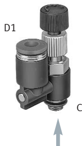
Differential Pressure Regulator, NPT, with Parallel Connector Housing: Polymer