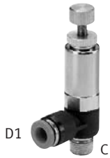
Pressure Regulator, UNF, without Gauge, with Elbow Connector Housing: Polymer