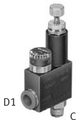
Pressure Regulator, NPT, with Gauge and Elbow Connector Housing: Polymer