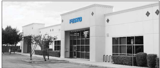
West: 4935 Southfront Road, Suite F, Livermore, CA 94550