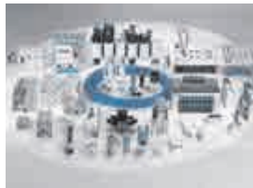
Pneumatics Pneumatic linear and rotary actuators, valves, and air supply