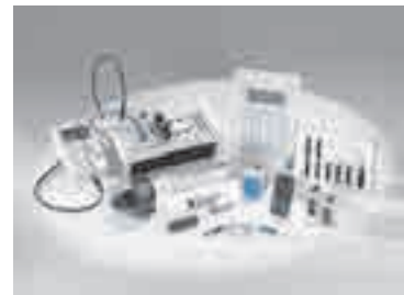
PLCs and I/O Devices PLC's, operator interfaces, sensors and I/O devices