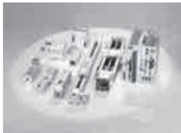
Electromechanical Electromechanical actuators, motors, controllers & drivers

With a comprehensive line of more than 30,000 automation components, Festo is capable of solving the most complex automation requirements.