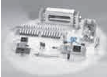
Custom Automation Components Complete custom engineered solutions

Our experienced engineers provide complete support at every stage of your development process, including: conceptualization, analysis, engineering, design, assembly, documentation, validation, and production.