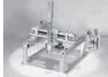
Complete Systems Shipment, stocking and storage services