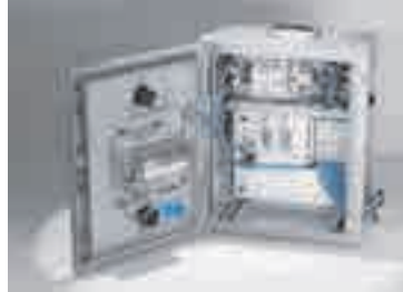
Custom Control Cabinets Comprehensive engineering support and on-site services