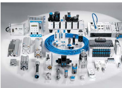
Pneumatics Pneumatic linear and rotary actuators, valves, and air supply