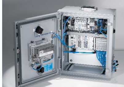
Custom Control Cabinets Comprehensive engineering support and on-site services