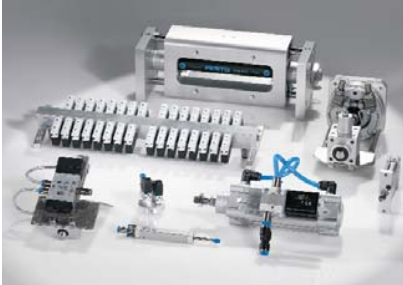
Custom Automation Components Complete custom engineered solutions

Our experienced engineers provide complete support at every stage of your development process, including: conceptualization, analysis, engineering, design, assembly, documentation, validation, and production.