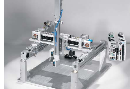
Complete Systems Shipment, stocking and storage services