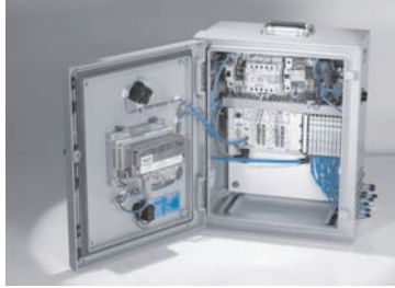
Custom Control Cabinets Comprehensive engineering support and on-site services