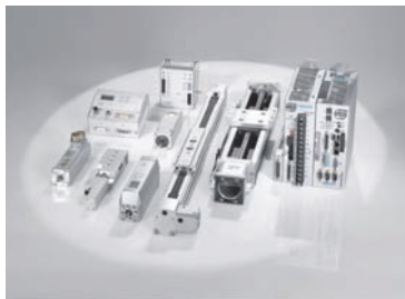
Electromechanical Electromechanical actuators, motors, controllers & drivers

With a comprehensive line of more than 30,000 automation components, Festo is capable of solving the most complex automation requirements.