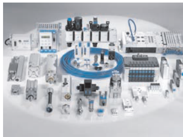
Pneumatics Pneumatic linear and rotary actuators, valves, and air supply