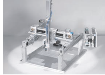
Complete Systems Shipment, stocking and storage services