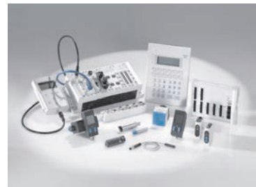
PLCs and I/O Devices PLC's, operator interfaces, sensors and I/O devices