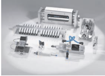
Custom Automation Components Complete custom engineered solutions

Our experienced engineers provide complete support at every stage of your development process, including: conceptualization, analysis, engineering, design, assembly, documentation, validation, and production.