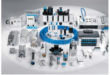
Pneumatics Pneumatic linear and rotary actuators, valves, and air supply