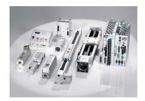
Electromechanical Electromechanical actuators, motors, controllers & drives

With a comprehensive line of more than 30,000 automation components, Festo is capable of solving the most complex automation requirements.