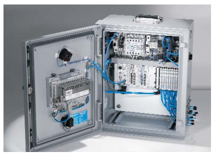
Custom Control Cabinets Comprehensive engineering support and on-site services