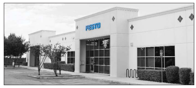
West: 4935 Southfront Road, Suite F, Livermore, CA 94550