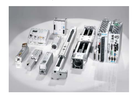
Electromechanical Electromechanical actuators, motors, controllers & drives

With a comprehensive line of more than 30,000 automation components, Festo is capable of solving the most complex automation requirements.