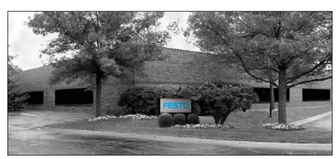
Central: 1441 East Business Center Drive, Mt. Prospect, IL 60056