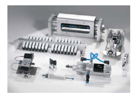
Custom Automation Components Complete custom engineered solutions

Our experienced engineers provide complete support at every stage of your development process, including: conceptualization, analysis, engineering, design, assembly, documentation, validation, and production.