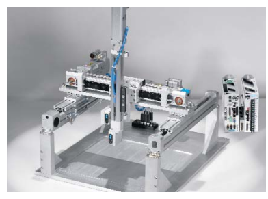
Complete Systems Shipment, stocking and storage services