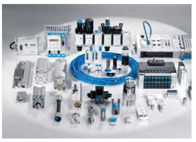
Pneumatics Pneumatic linear and rotary actuators, valves, and air supply