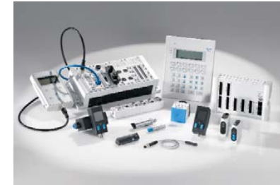
PLCs and I/O Devices PLC's, operator interfaces, sensors and I/O devices