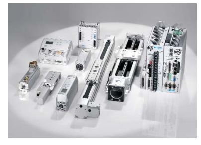
Electromechanical Electromechanical actuators, motors, controllers & drives

With a comprehensive line of more than 30,000 automation components, Festo is capable of solving the most complex automation requirements.