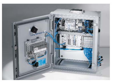
Custom Control Cabinets Comprehensive engineering support and on-site services