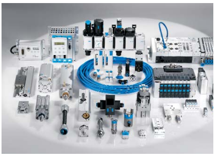
Pneumatics Pneumatic linear and rotary actuators, valves, and air supply