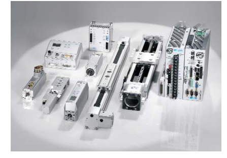
Electromechanical Electromechanical actuators, motors, controllers & drives

With a comprehensive line of more than 30,000 automation components, Festo is capable of solving the most complex automation requirements.