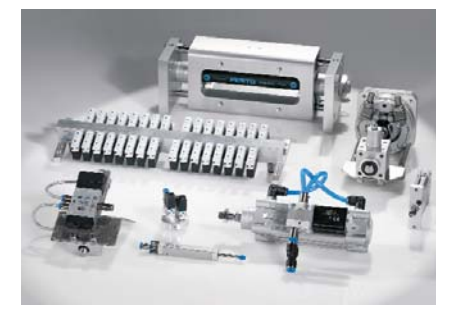
Custom Automation Components Complete custom engineered solutions

Our experienced engineers provide complete support at every stage of your development process, including: conceptualization, analysis, engineering, design, assembly, documentation, validation, and production.