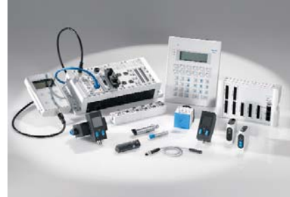
PLCs and I/O Devices PLC's, operator interfaces, sensors and I/O devices