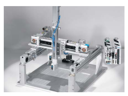
Complete Systems Shipment, stocking and storage services

Custom Control Cabinets Comprehensive engineering support and on-site services