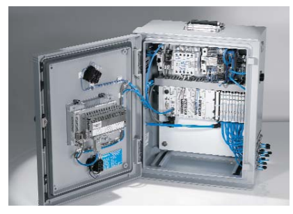
Custom Control Cabinets Comprehensive engineering support and on-site services