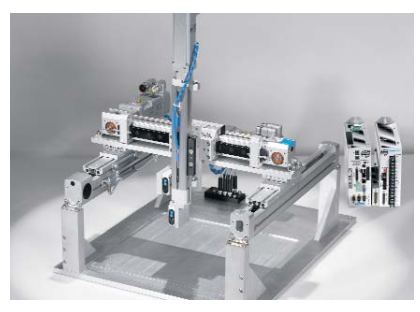
Complete Systems Shipment, stocking and storage services