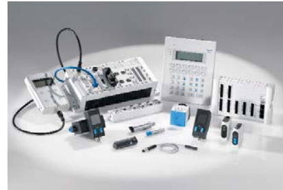
PLCs and I/O Devices PLC's, operator interfaces, sensors and I/O devices