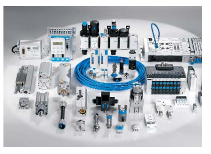
Pneumatics Pneumatic linear and rotary actuators, valves, and air supply