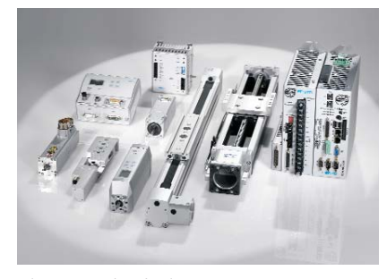
Electromechanical Electromechanical actuators, motors, controllers & drives

With a comprehensive line of more than 30,000 automation components, Festo is capable of solving the most complex automation requirements.