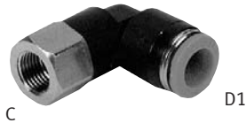
Push-in Elbow Fitting, NPT, with Female Thread