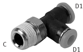
Push-in Branch T Fitting, NPT