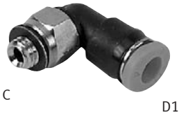
Push-in Elbow Fitting, UNF