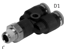
Push-in Y Fitting, NPT