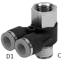
Push-in Elbow Y Fitting, NPT, with Male and Female Thread