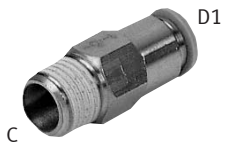
Push-in Straight Fitting, NPT, with Check