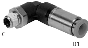
Push-in Elbow Fitting, NPT, with Check