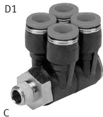
Push-in Elbow Double Y Fitting, NPT