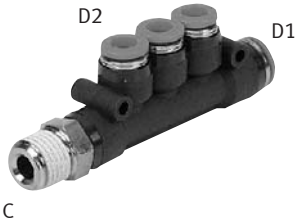
Push-in Triple Branch Reducing T Fitting, NPT