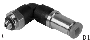
Push-in Elbow Fitting, UNF, with Check