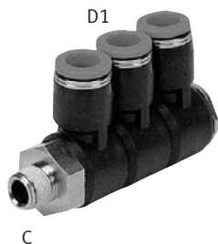
Push-in Triple Elbow Fitting, NPT