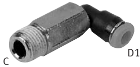
Push-in Elbow Fitting, NPT, Long