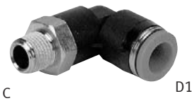
Push-in Elbow Fitting, NPT