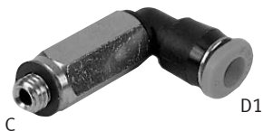
Push-in Elbow Fitting, UNF, Long