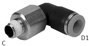
Push-in Elbow Fitting, NPT with Ball Bearing