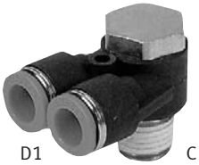
Push-in Elbow Y Fitting, NPT, with External Hex