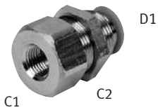
Push-in Bulkhead Fitting, with Female NPT Thread