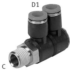
Push-in Double Elbow Fitting, NPT