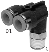
Push-in Elbow Y Fitting, NPT