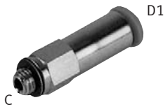
Push-in Straight Fitting, UNF, with Check