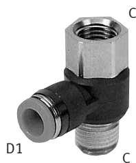
Push-in T Fitting, NPT, with Male and Female Thread