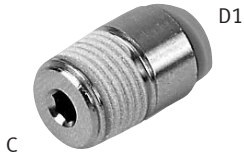
Push-in Straight Fitting, NPT, with Internal Hex