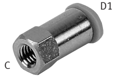
Push-in Straight Fitting, UNF, with Female Thread