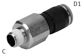
Push-in Straight Fitting, NPT with Ball Bearing