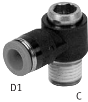
Push-in Elbow Fitting, NPT, with Internal Hex