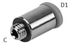
Push-in Straight Fitting, UNF, with Internal Hex