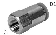
Push-in Straight Fitting, NPT, with Female Thread