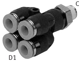
Push-in Double Y Fitting, NPT