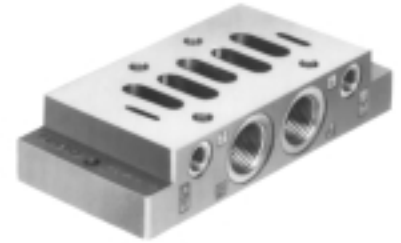
Type NAS-1/2-3A-ISO NAS-1/2-NPT-3A