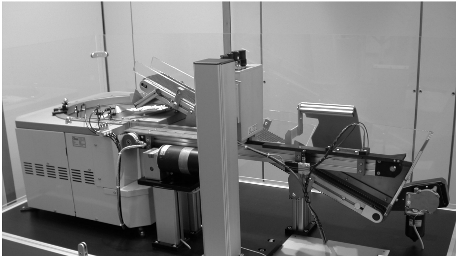
Competent part detection

Festo's Checkbox Compact is a component for optical type identification, position and quality inspection of small parts when feeding modern automatic assembly and production machines. You can use the Teach-In function to teach the system up to 4 parts in a matter